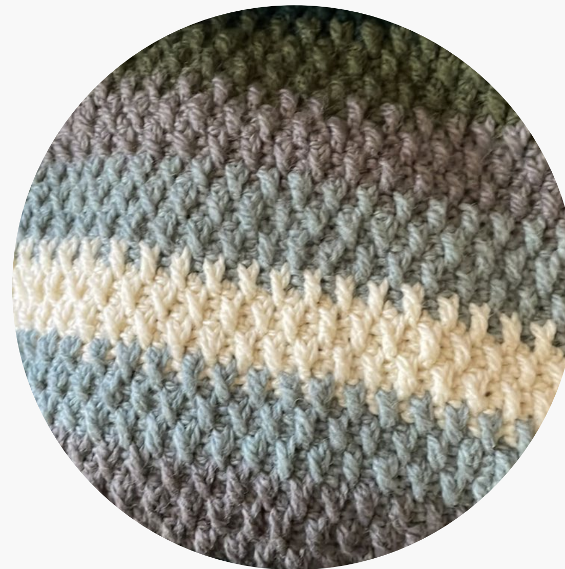
A portion of a crocheted blanket made by Ru